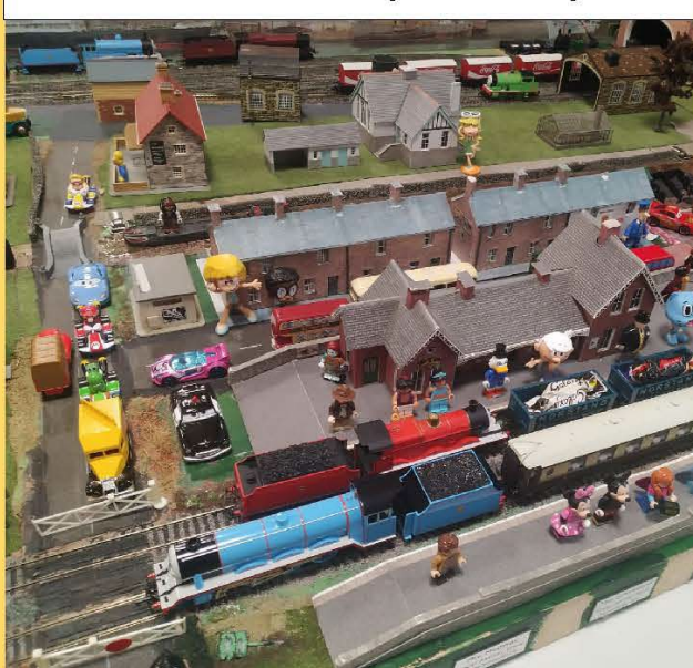
Windmill Hill – Children's layout owned by GRES